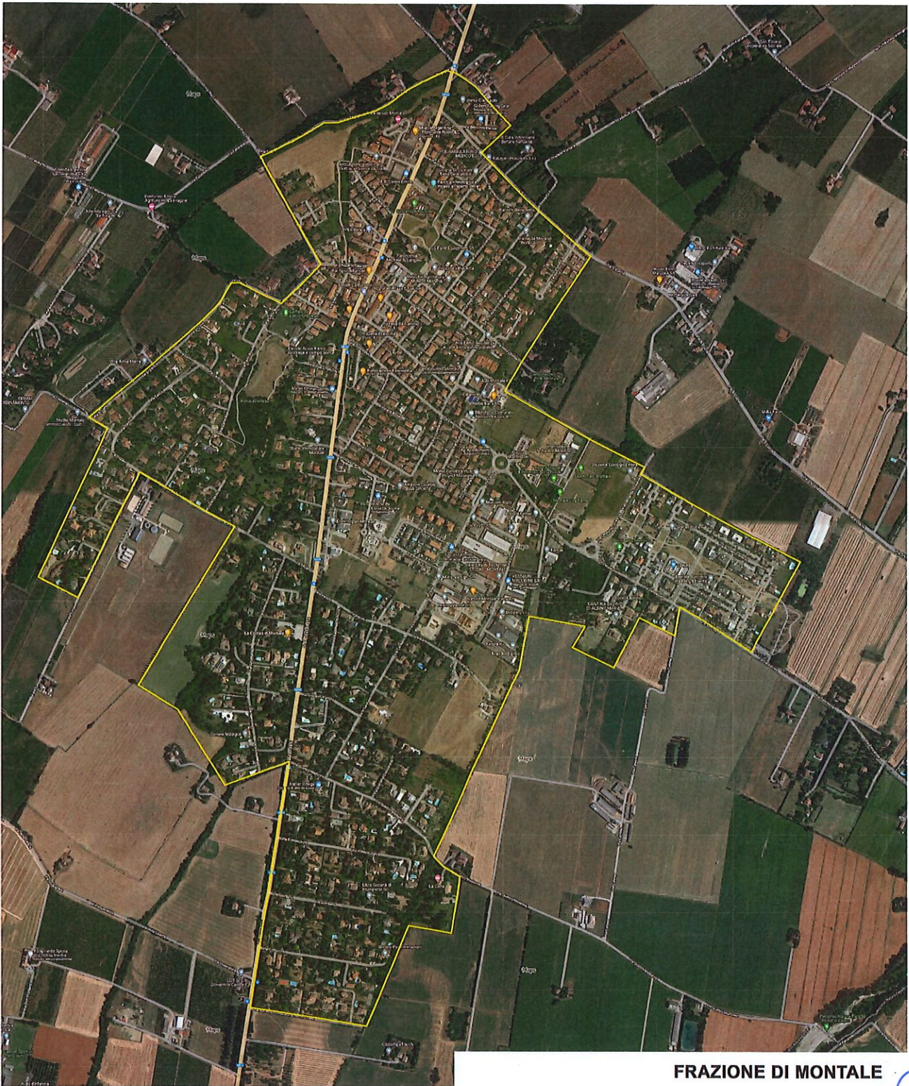
FRAZIONE DI MONTALE

(firmato il 16.11.2023, depositato il 21.11.2023, con decorrenza 01.12.2023)